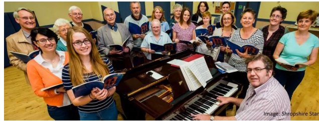
Shropshire Star feature, September 2015