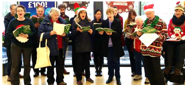
Newport Aldi carols, December 2015