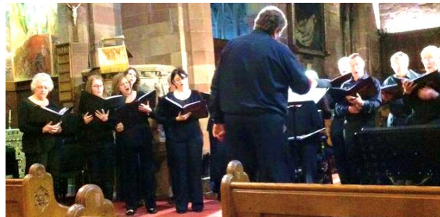
Drayton Arts Festival, October 2015